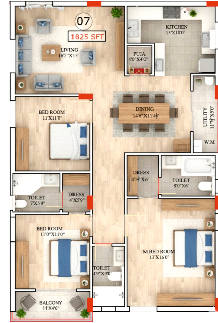
FLAT - 7,8,9,10 - 1825 Sft