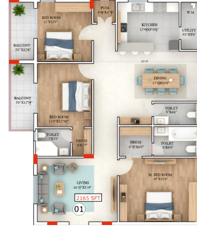
FLAT - 1 - 2165 Sft