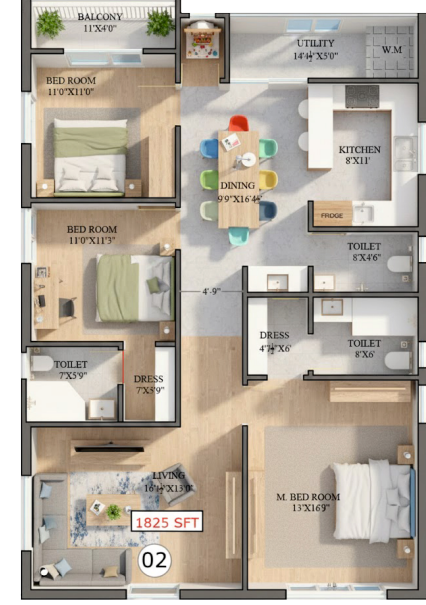
FLAT - 2,3,4,5 - 1825 Sft