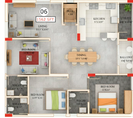
FLAT - 6 - 1562 Sft