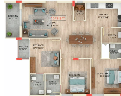
FLAT - 11 - 1579 Sft